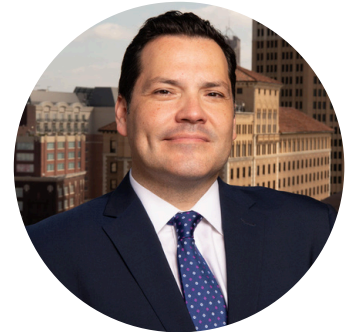
Justin Rodriguez Bexar County Commissioner Precinct 2