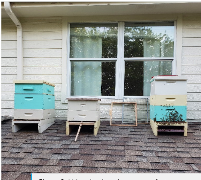
Figure 2. Urban beekeeping on a roof (Thomas Lawson)