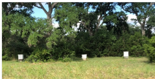
Figure 1. Apiary with a barrier of trees and shrubs, separating hives from a street. These hives are also in full sun in the morning and full shade in the afternoon.

A geographic barrier of dense trees or shrubs separating hives from neighbors allows a space to walk through to “brush” bees off if they are following the beekeeper when leaving the hive (Fig. 1). The beekeeper needs to create adequate distance to walk from the hive to allow bees to leave them before returning indoors.