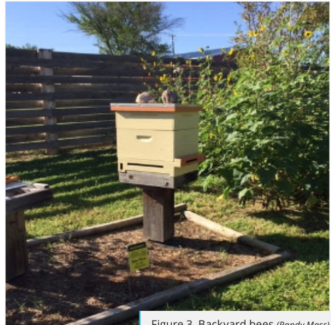
Figure 3. Backyard bees (Randy Mass)

https://agrilifelearn.tamu.edu/product?catalog=ENTO-025