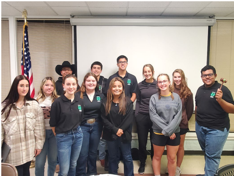
2022-2023 Bexar County 4-H County Council Officer Team