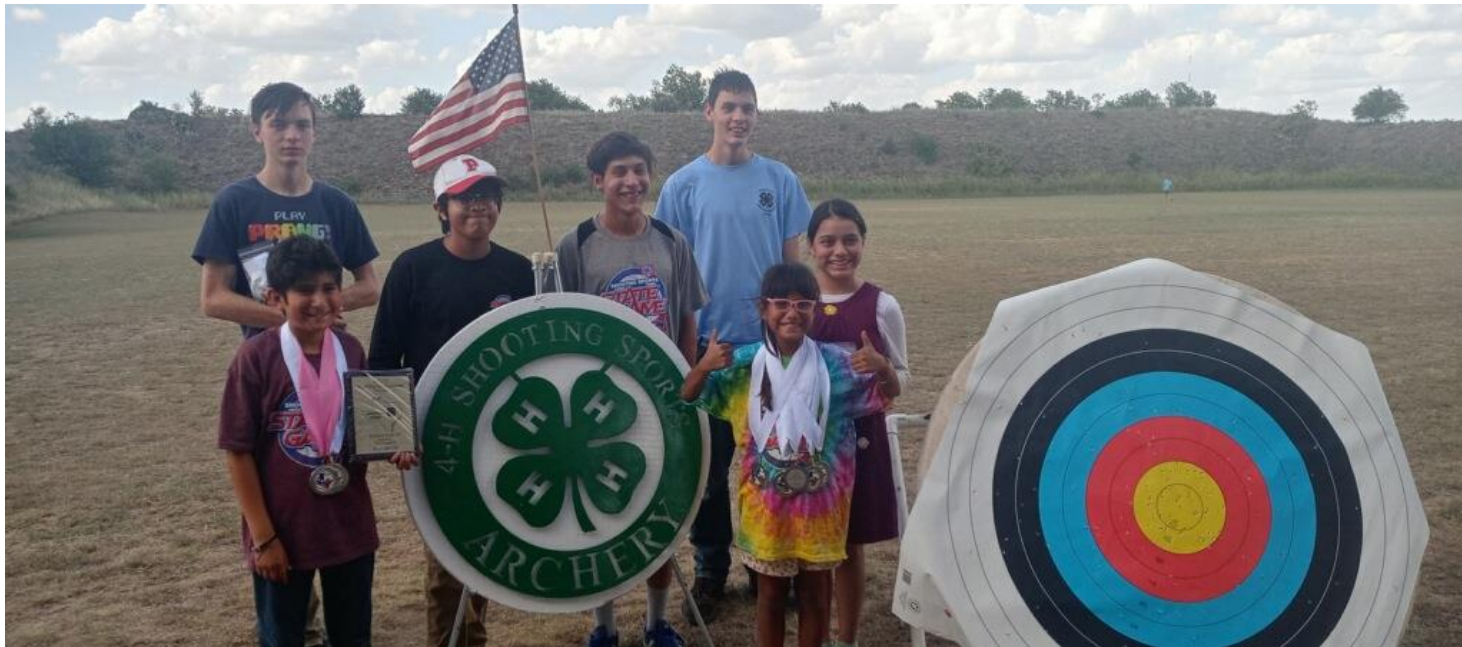
4-H State Archery Contest: A-Team 4-H, San Antonio Homeschooler's 4-H & 4-H Express