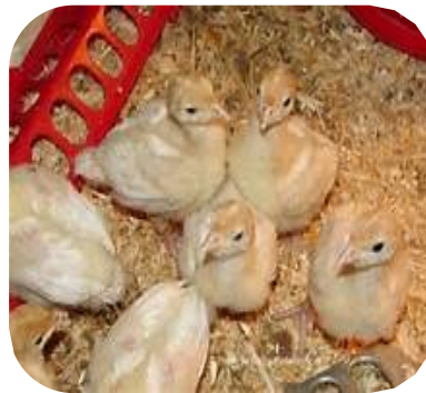
Learn about raising show turkeys