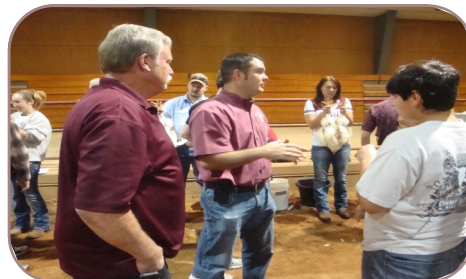
Learn from the "experts", ask them ?s