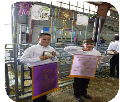
Past participants then winners