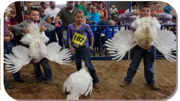
Learn about selection and showing your birds