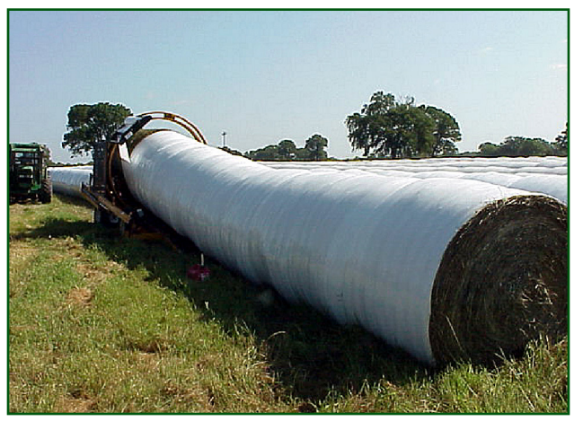
Figure 8. Multiple high moisture "haylage" bales being wrapped in plastic.

Haylage involves baling forage with 45 to 55 percent moisture content, then putting the bales into airtight storage. Haylage is typically wrapped in plastic to exclude air. Aerobic (free oxygen requiring) bacteria then consume the oxygen remaining inside the hay within a few hours. Under these conditions, anaerobic (non-free oxygen requiring) bacteria reduce the forage pH and preserve the forage in a more or less "pickled" state. The low pH inhibits mold and respiration losses that typically occur in high-moisture bales. Haylage does not, however, attain as low a pH as silage so it cannot be stored as long. The cost to wrap long strings of round bales (Fig. 8) or individual bales (Fig. 9) is about $5 to $7 per bale. While haylage reduces leaf shatter loss and allows you to preserve high-moisture forage, it is typically fed on-farm because it cannot be moved easily.