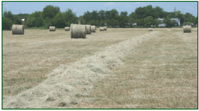
Figure 5. Dried forage after being raked into a windrow.