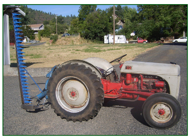
Figure 2. Sickle-bar type cutter.

The first step in hay production is the actual cutting of the hay. Hay mowers fall mainly into two classes — sickle-bar cutters (Fig. 2) and disk mowers (Fig. 3). Sickle-bar mowers have long cutting heads with reciprocating teeth. Disk mowers have cutting heads with several small rotating cutters. In the past, it was difficult to adjust cutting height and most mowers left a stubble height of 2 inches or less. Cutters today are more adjustable and a higher cut leaves some leaf material to support photosynthesis and encourages a more rapid recovery from the harvest.