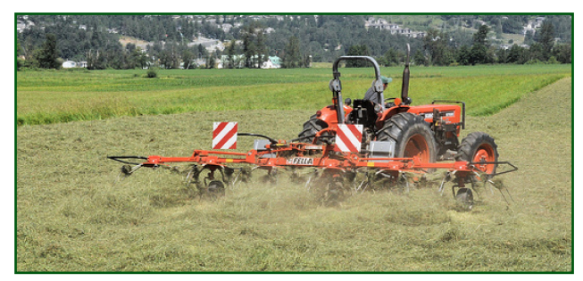
Figure 6. Tedder used for inverting dried forage to speed drying.