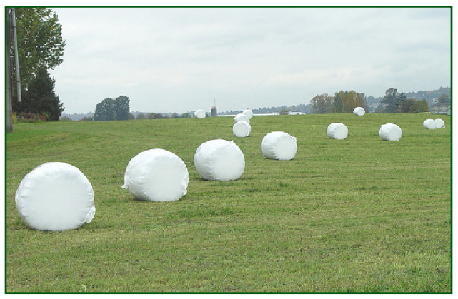
Figure 9. High moisture "haylage" bales individually wrapped in plastic.