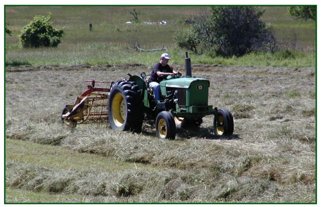
Figure 4. Dried forage being raked into windrows.

After cutting, the hay should remain in the field to dry or "field cure." The dried or cured forage is then raked (Figs. 4 and 5) into windrows that are the width of the take-up header of the baler. Sometimes a heavy dew, high relative humidity, or rain will cause the windrow to be dry on top but wet underneath. When this happens you can use an implement called a tedder to turn the windrow over to help it dry (Fig. 6). Once the moisture content in the windrow has reached the appropriate level, the forage can be baled into round or square bales.