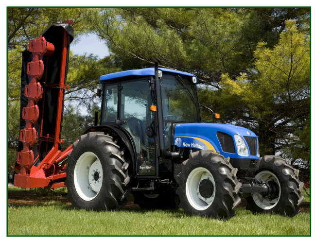
Figure 3. Disk mower cutter.